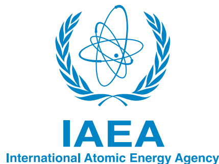
Figure 1: Canada is member state and as such is committed to its Regulations

International Atomic Energy Agency is widely known as the world's "Atoms for Peace" organization within the United Nations family, the IAEA is the international Centre for cooperation in the nuclear field. The Agency works with its Member States and multiple partners worldwide to promote the safe, secure and peaceful use of nuclear technologies.