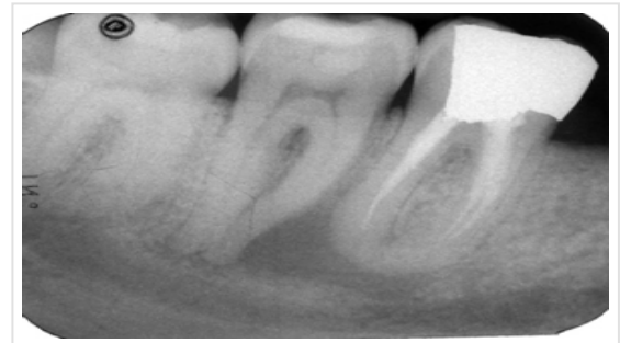
Figure 1b. Intraoral apical radiography