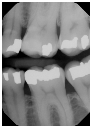
Figure 3: Display image (enhanced, normalized...) on the monitor

Step 3: Display of image of teeth on Monitor.