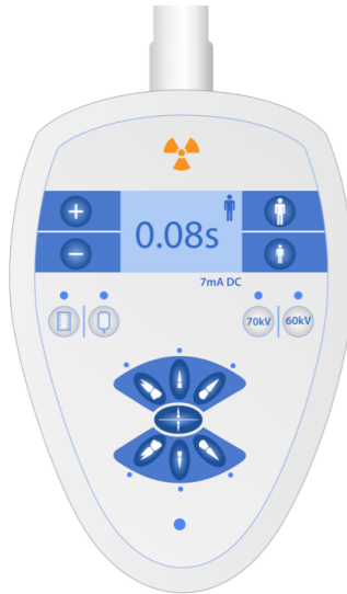
Figure 2: Set the technique as specified by sensor and expose

Step 2: Set the technique, IQ(D)P and Clinical Imaging.